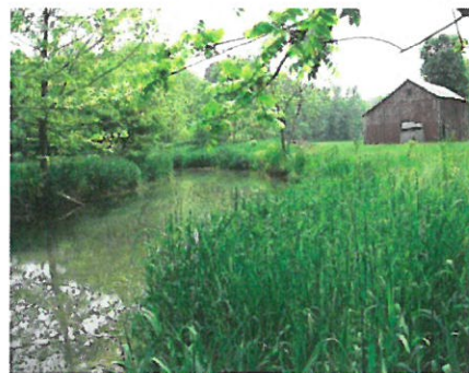
A riparian buffer is located on only one side of the stream. Because of the lack of stream protection, the other side is washing out.