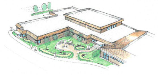
New Borough Building Concept Plan

We have applied for a grant to aid in funding this exciting new project that will be an asset to our wonderful community.